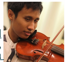
WATCH: Blind Boys' Academy, India