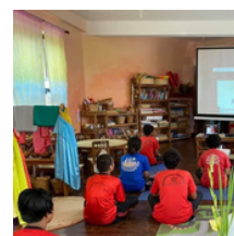
READ: Special Projects, Nepal