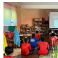
READ: Special Projects, Nepal