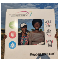
WATCH: The Award in Zambia: Plan, Do and Review

Explore the 120+ countries and territories of the Award here