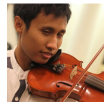
WATCH: Blind Boys' Academy, India