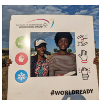
WATCH: The Award in Zambia: Plan, Do and Review

Explore the 120+ countries and territories of the Award here