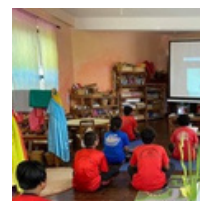
READ: Special Projects, Nepal